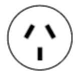
Australian Power Outlets

The power supply in Australia is 220-240V, 50Hz. A step down transformer is needed to convert the current to 110-120 V. Australian plug adaptors have two flat prongs in an inverted “V” shape, and some also have an earth connector. Delegates are encouraged to bring their own electrical adaptors if required.